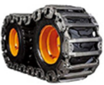
Over The Tire Tracks