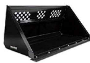
Snow or Light Material Bucket