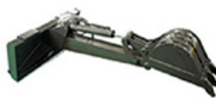
Utility Digging Backhoe