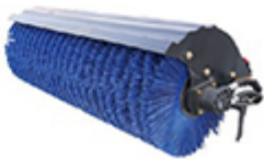
Power Angle Broom