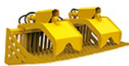
Grapple Rock Bucket