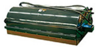
Pick Up Broom