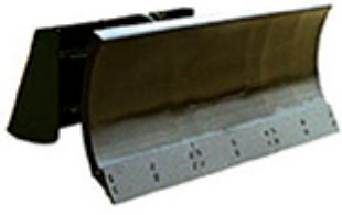
Dozer Blade Grader Leveler